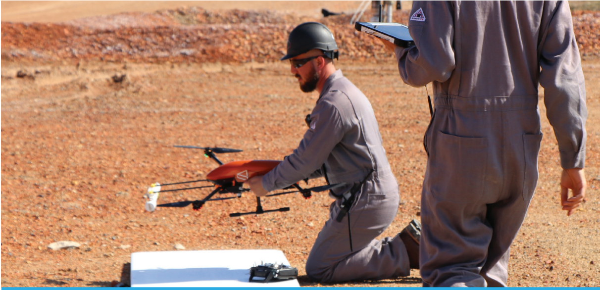
Using drones to fly over oil and gas facilities to detect methane leakage and flaring in Colorado

But right at that moment, a revolution was taking place in the energy sector. New technology—hydraulic fracturing, horizontal drilling, 3D seismic and other innovations—gave the oil and gas industry access to huge amounts of natural gas they'd never been able to reach before. Natural gas burns much cleaner than coal. And it had become so much cheaper. Suddenly, utility executives were beginning to think differently about their existing coal-fired plants and their options going forward.