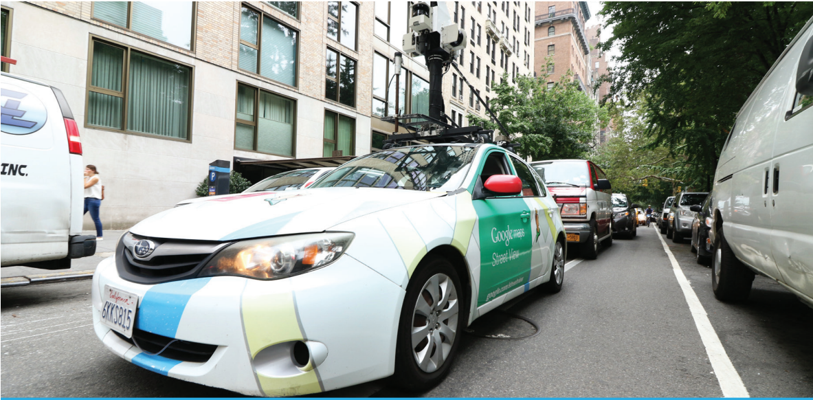
EDF teamed up with Google Earth Outreach to pinpoint methane leaks under our streets and sidewalks from natural gas pipes.