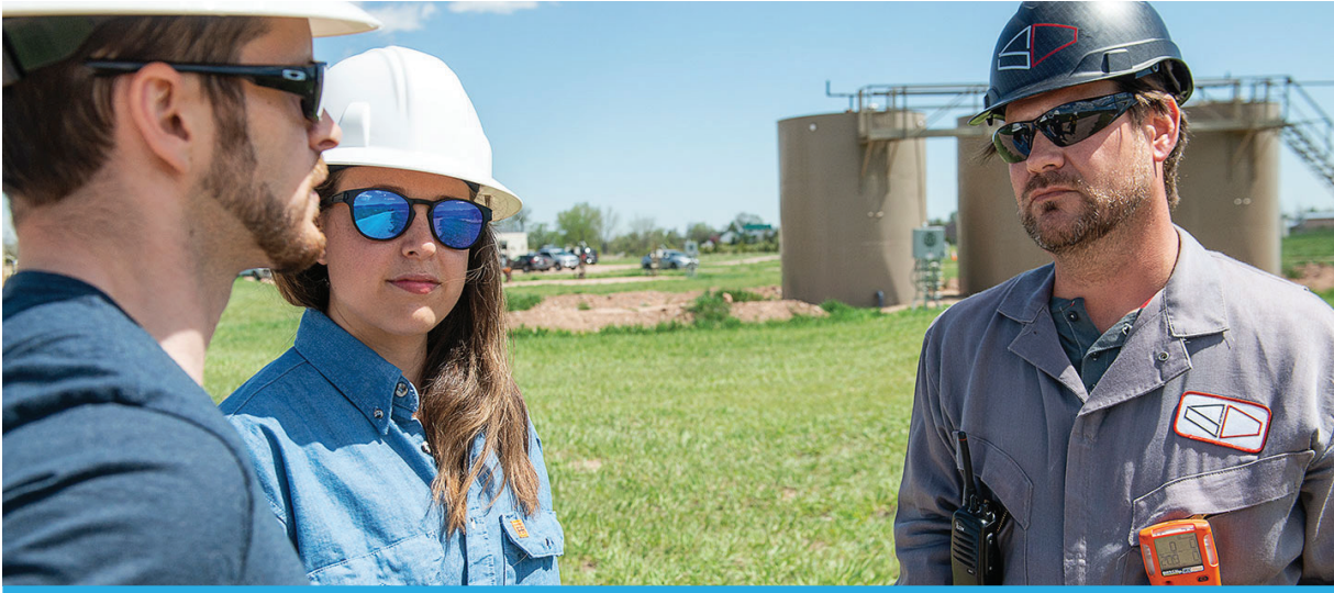
On-site testing for methane emissions at a natural gas facility.