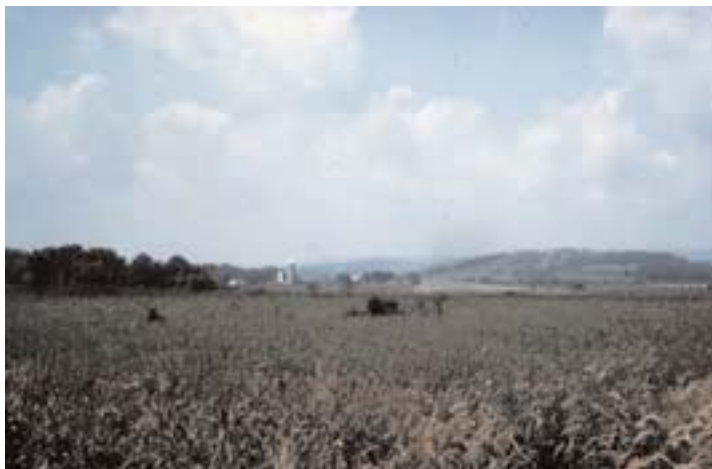
U.S. Fish and Wildlife Service