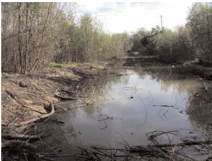
Natural Resources Conservation Service

Since PIR's inception, conservation efforts at more than 35 sites on 30 farms have kept 57,000 tons of sediment out of waterways