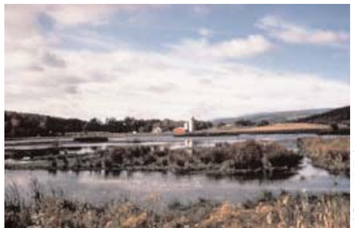
U.S. Fish and Wildlife Service