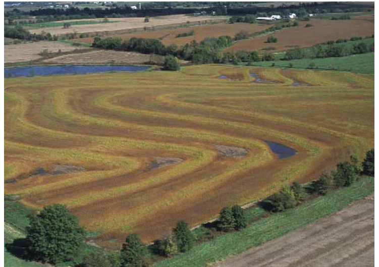
Natural Resources Conservation Service

To learn more about the distribution of EQIP dollars to