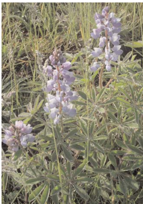
Wild lupine ( Lupinus perennis )