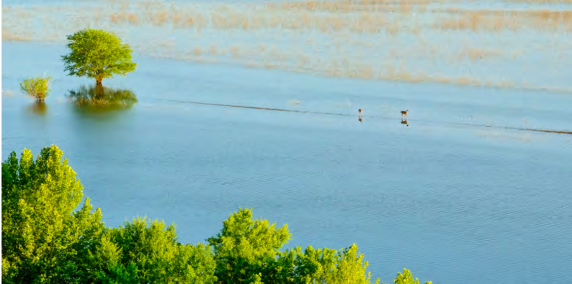
View of field and trees flooded by Missouri River and two deer walking through.