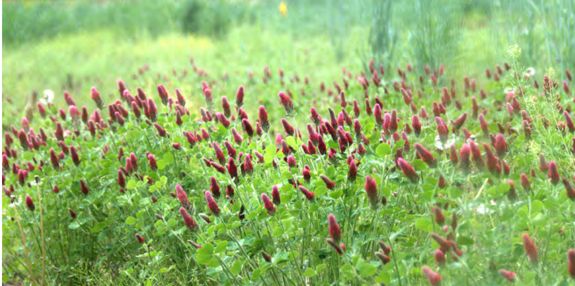
Crimson clover (useful as cover crop) growing in a test plot at University of Missouri Extension Bradford Research Center.