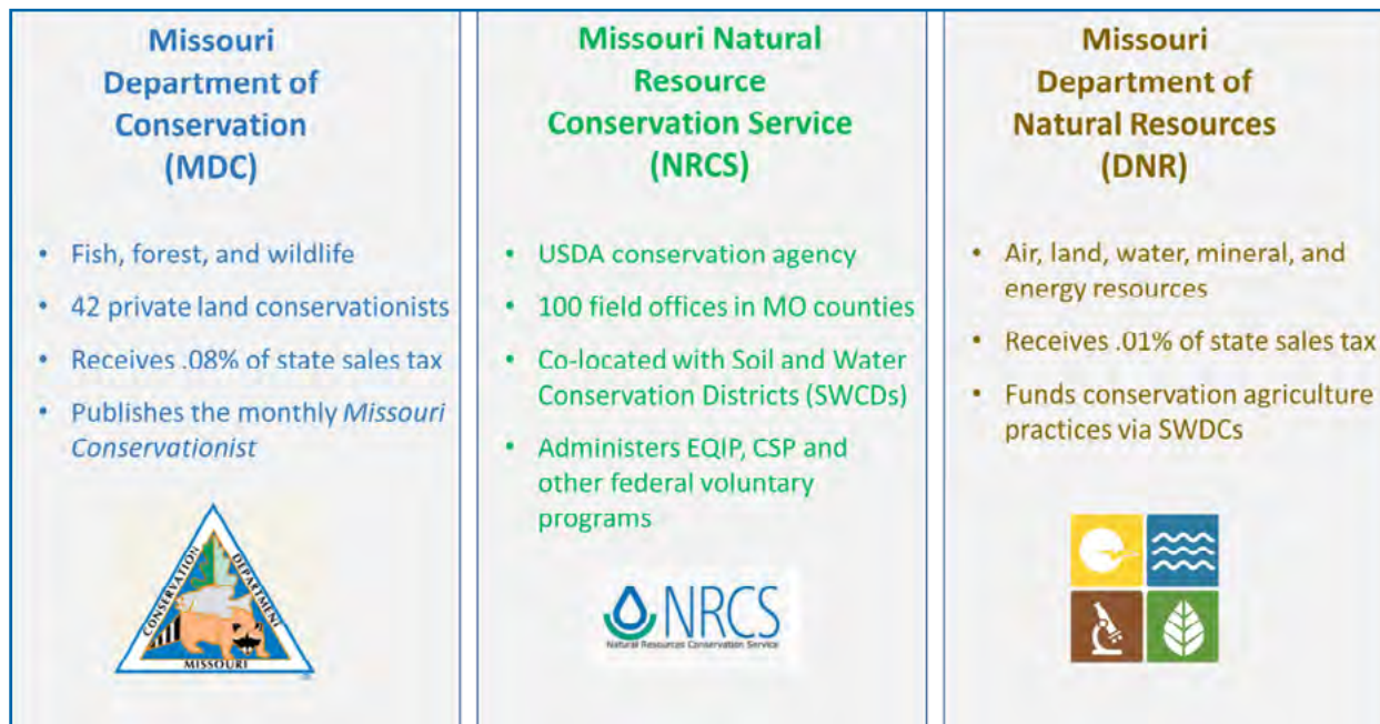
Figure 1: Profiles of MFA’s Missouri Conservation Agency Partners: MDC, NRCS, DNR.

MFA Incorporated sprang to mind. MFA is a farmer-owned cooperative representing 45,000 farmers and ranchers throughout Missouri and parts of neighboring states. 7 It markets grain from its member-owners and provides farm inputs, hardware, and agronomy services. One of its distinguishing features is expertise in precision agronomy, a management approach that uses farmers’ own data to understand what their crops and soil need in order to stay healthy and use inputs efficiently. Land stewardship is one of MFA’s core values. With its 130 locations (see Figure 2) and expertise in precision ag, the cooperative had vast potential to promote conservation agriculture practices such as cover crops, no-till, expanded rotations, and others. The two agencies quickly concluded that MFA made an obvious partner for this conservation collaboration.