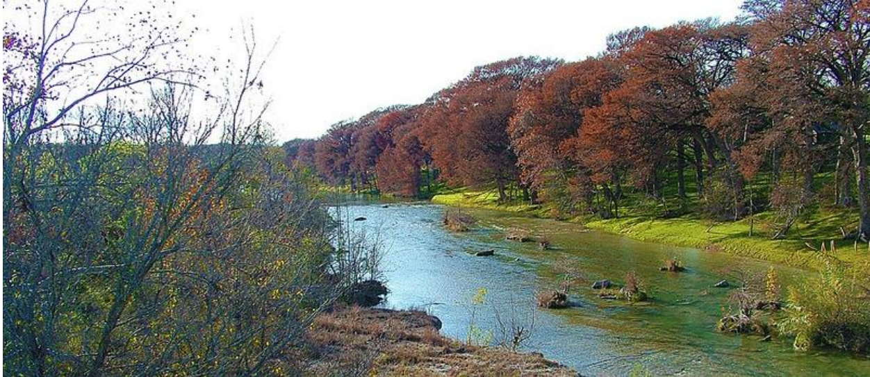
Hays County funded the development of a groundwater/surface water model in the Blanco River Watershed.

The process to develop special groundwater management zones in Hays Trinity GCD illustrates all three of these approaches in tandem. 58 To better understand how decreasing groundwater levels were impacting wells and spring flow in a certain area within the district, the Hays Trinity GCD formed a scientific technical committee composed of technical staff from the GCD, neighboring management agencies, and the Meadows Center for Water and the Environment. The committee completed an evaluation of groundwater flow, delineated the area contributing flow to the spring, assessed geologic characteristics affecting recharge rates and flow gradients, and identified management zones and suggested approaches for each zone (such as new operating permit restrictions in certain areas, recharge zones, etc.). The recommendations also prioritize areas where additional studies should be conducted.