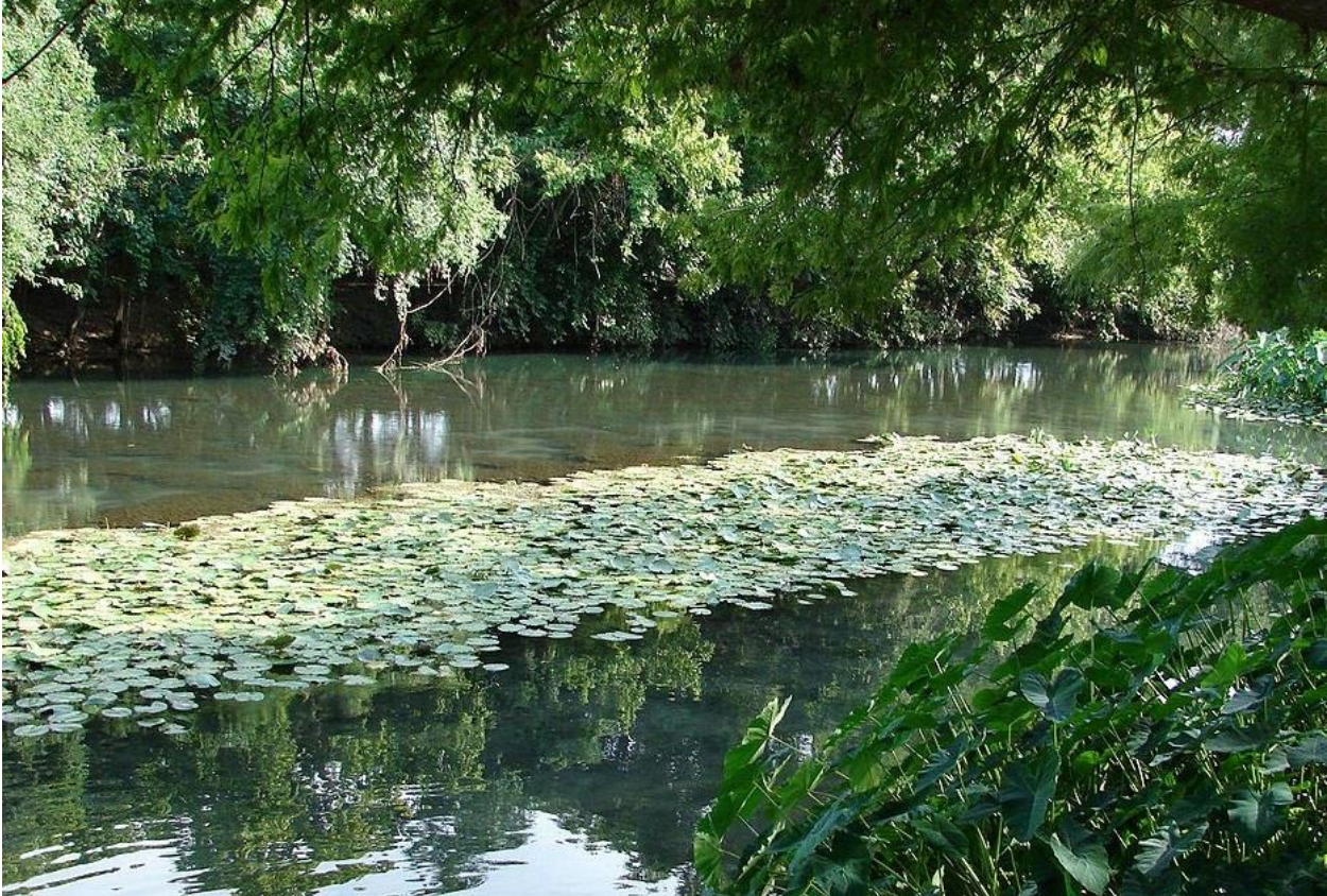
The Comal River starts at Comal Springs, which is fed by the Edwards Aquifer. Trading is utilized in the Edwards Aquifer to secure water, as production from the aquifer has been capped to protect spring flow.