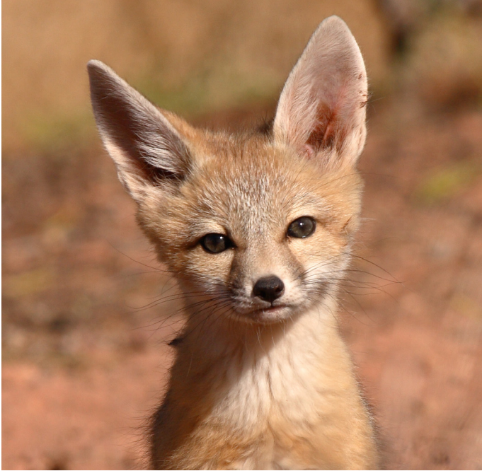
Restoring habitat for species like this San Joaquin kit fox is one land repurposing option growers can use to conserve groundwater.